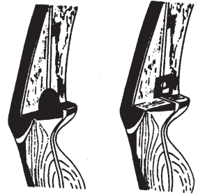
Hair (rug) Rest Elevator Rest

All Martin (Howatt) bows, with the exception of traditional longbow models, are designed to be shot either from an elevated arrow rest or directly off of the arrow shelf. An elevated arrow rest provides increased fletching clearance and is helpful when using plastic vanes. Shooting off of the shelf allows the arrow to be held closer to the bowhand which is helpful to instinctive shooting. It is recommended, when shooting off of the shelf, that you pad the arrow shelf and the portion of the sight window directly above the pivot point with a rug rest or hair rest.